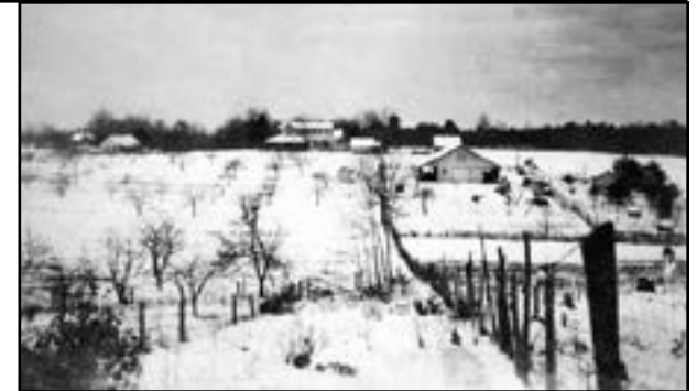
Snowy view from James Blvd. before Taft Highway was built.

big beautiful Christmas tree the Bachmans so carefully prepared every year to share with all their neighbors. What a thrilling sight it was!