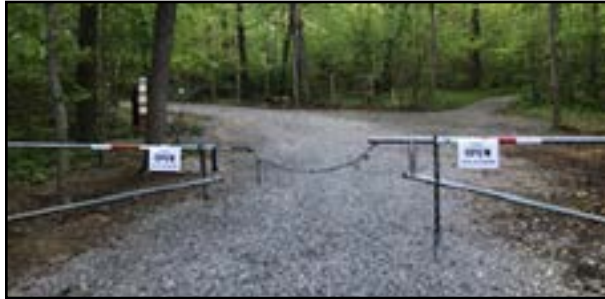
Taft entrance old internal security gate, March 2020