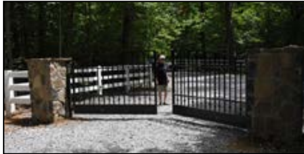
Taft entrance new internal security gate, September 2020