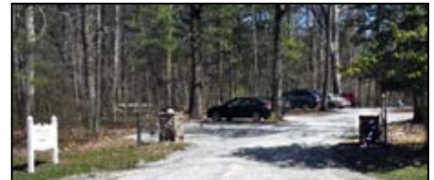
Taft Highway interim entrance March 2020

Though most everyone will remember 2020 as the year of the Pandemic , it was a year of Progress for McCoy Farm & Gardens thanks to the generosity of folks like you and the Tucker