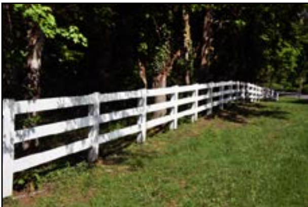
New white fences along Anderson Pike and along the back drive to the newly expanded parking lots, June 2020