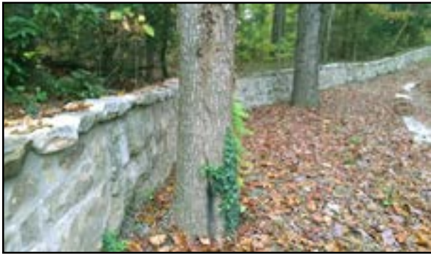
Restored stone wall at the homesite, October 2020