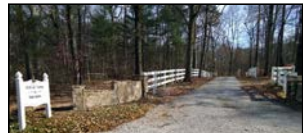
Taft Highway new entrance November 2020

The Mission of McCoy Farm & Gardens is to restore, enhance and preserve the historic McCoy homeplace so that it may serve the community as an arboretum, natural area, and venue for public and private events.