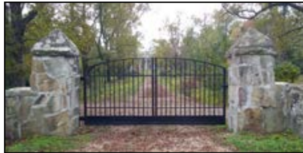
Restored Anderson Pike entrance with coordinating gate