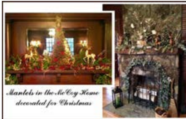
Mantels in the McCoy Home decorated for Christmas

The decorated mantels will serve as a backdrop for Family Holiday Photos offered by the Walden's Ridge Civic League annual fundraiser. The two organizations enjoy working together for the benefit of the community.