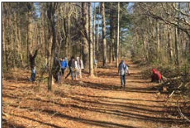
Members of the McCallie Leo Club remove invasive vines and undergrowth along the trail.