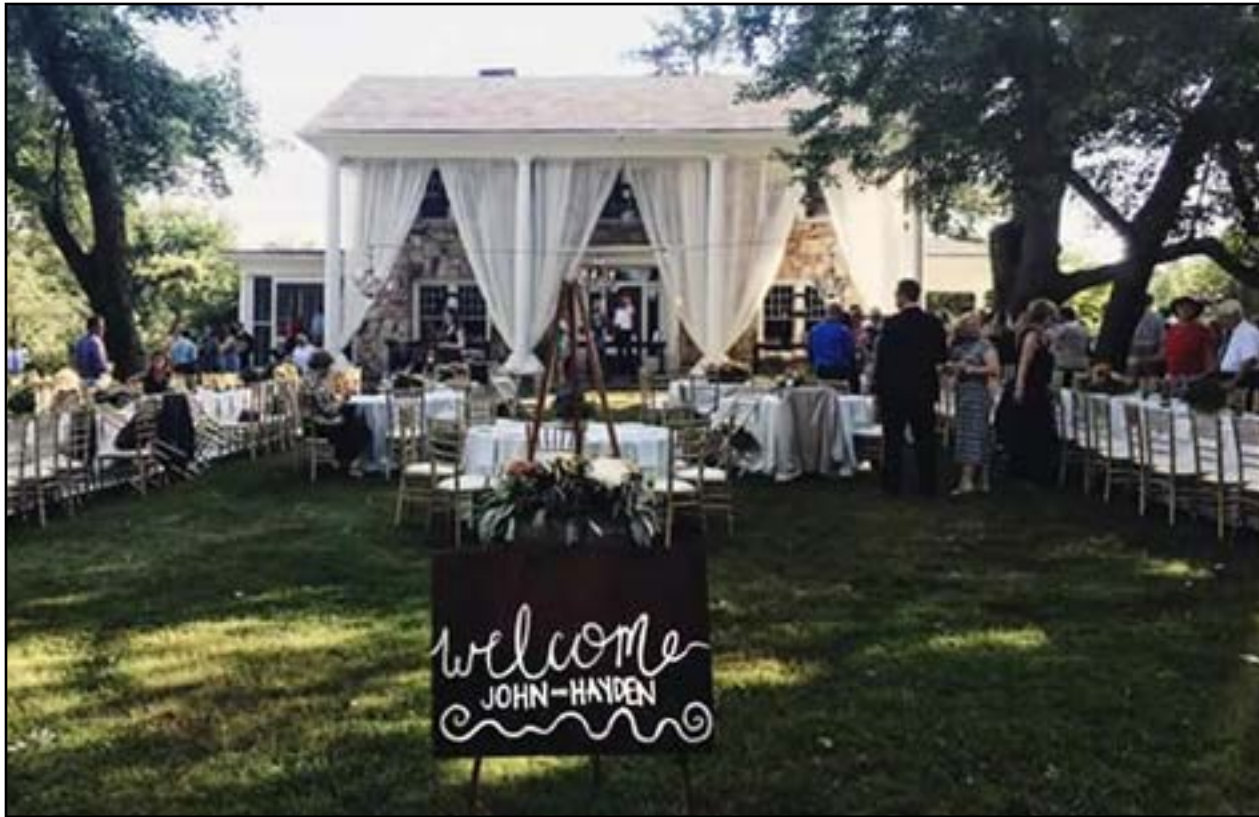
The front porch of the McCoy Home draped dramatically for the Price-Sasse wedding reception

married at the Signal Mountain Presbyterian Church. Their celebratory party was the first such event held on the grounds since the property became available for such use.