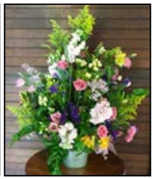
Flower arrangements by Wanda Lacy graced tables.