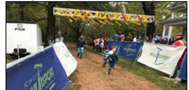
A couple of middle schoolers run past the McCoy house.

concessions and much more. Many athletes also participated in the Zombie 5K Trail/1 mile "Not So Scary" Fun Run.