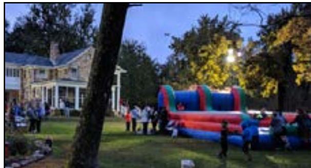
Crowds enjoying the huge inflatables and bounce house.

The Signal Mountain Middle/High Boosters report their fund raising events held recently at McCoy Farm & Gardens were a big success. There were long lines anticipating spooky treats and terror in the Haunted Barn on Friday & Saturday nights, October 27 - 28.