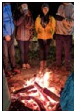
Appreciating the fire pit

The Halloween Festival on Saturday featured smashing pumpkin baseball, human foosball, huge inflatables, music, the Great Pumpkin Charlie Brown outdoor movie, games, food trucks/