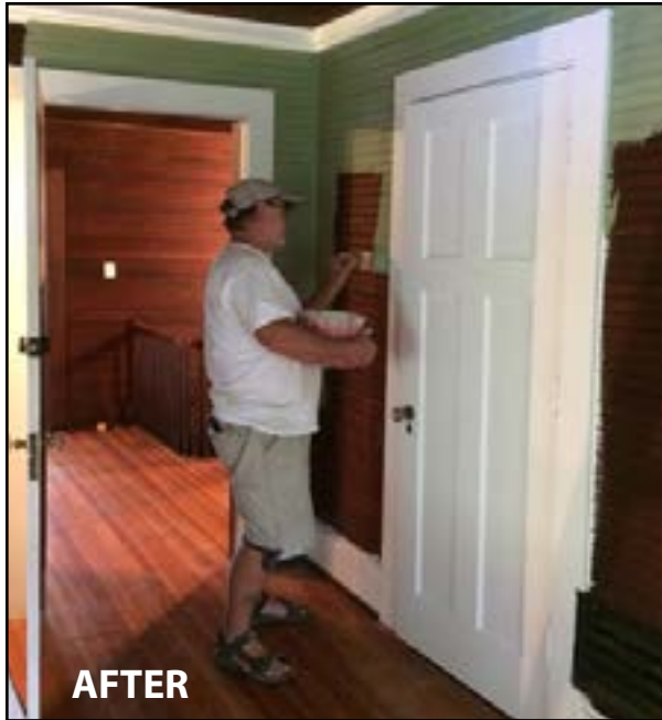
Painting in progress upstairs.