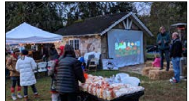
Watching Great Pumpkin Charlie Brown on the big screen.

The Halloween Festival on Saturday featured smashing pumpkin baseball, human foosball, huge inflatables, music, the Great Pumpkin Charlie Brown outdoor movie, games, food trucks/