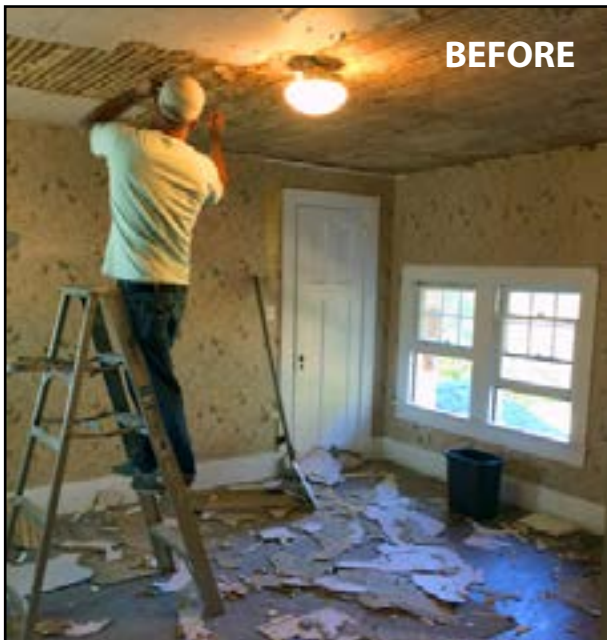
Before, the upstairs room had damaged and faded wallpaper. The ceiling and floor were timeworn. The lighting and electrical service needed attention.

Thanks to your generous help, we continue to make progress in repairing and refurbishing the McCoy home. A second upstairs room has been stripped of faded, peeling wallpaper. Walls and woodwork have been repainted. The floors are refinished, and light fixtures are being installed. Come and see!