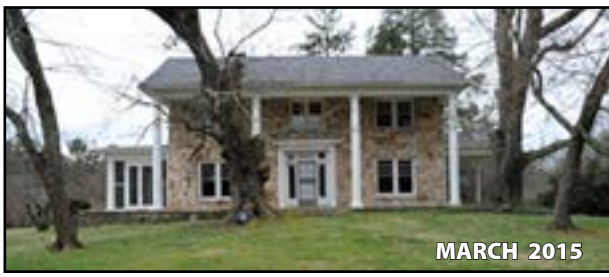
The house in March 2015 with two big trees crowding the front porch. The one on the left was removed in 2016.