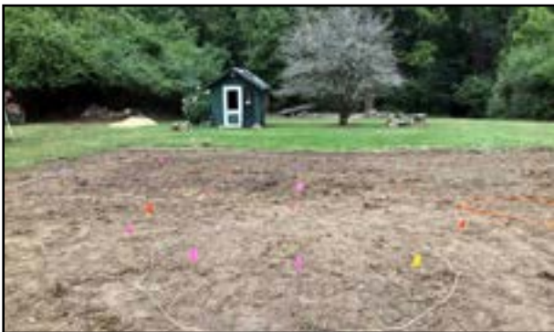
Clearing and preparing ground for the Children's Garden.

A heritage bed at the entrance will feature old-fashioned varieties like those Mrs. McCoy planted. This legacy bed leads into a new garden specifically designed for children to enjoy. It will feature a maze-like arrangement with little cul-de-sacs for "hiding" and play. The plants will be chosen for their textures, sizes, colors, scents, and general appeal to the senses of everyone, large or small. The new garden will