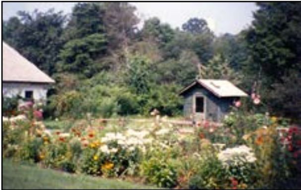
Martha McCoy's garden is shown in a picture furnished by her daughter, Sally Garland.

and marked with rope and little flags. This is in preparation for a new garden to be established there in the spring after all vegetation is completely removed. The Bachman and McCoy families planted flower gardens in this general area where the water from the well could be used for the plants.