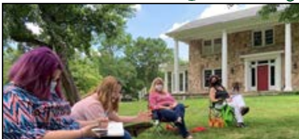
Rehearsing on the lawn for the play, Southern Exposure