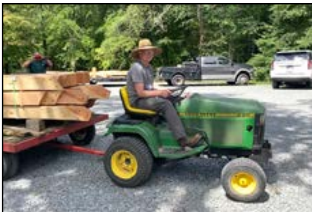
Volunteer Terry Knox hauls some of the timbers for the new structure. Other parts are on the trailer in the background.

The space will house an interactive map, visitor log, donation box, and information about upcoming events. The pictures show excavation underway and pre-cut lumber being unloaded and stored until construction can begin. The timber-frame shelter will be built with Douglas fir and mountain stone.