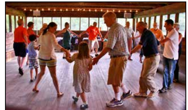
Children and adults had fun circling the floor together.