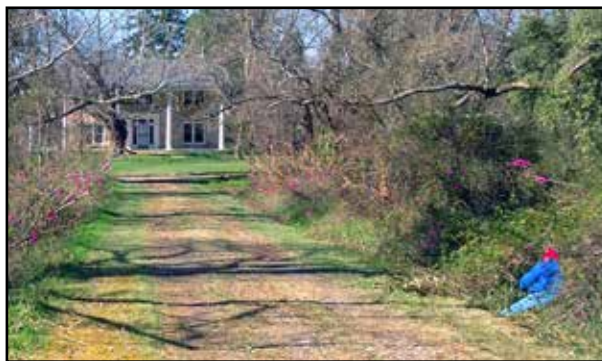
Volunteer clearing overgrown honeysuckle, April 9, 2015