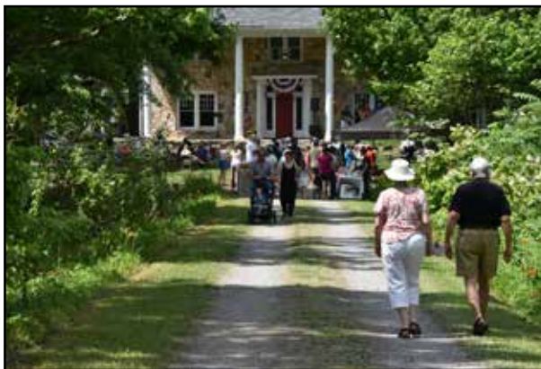
Walking down the same driveway, May 25, 2015