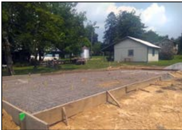
Above the footprint of the new shed, you can see the barn and corn-crib through the trees on the left. The area behind the barn will be a place to learn about small family farms.